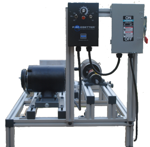
Model Shown MEC-101 with Motor and Drive Add-on