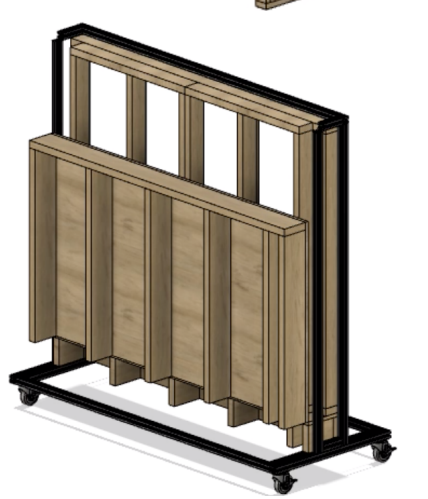
Fully expanded with roof section